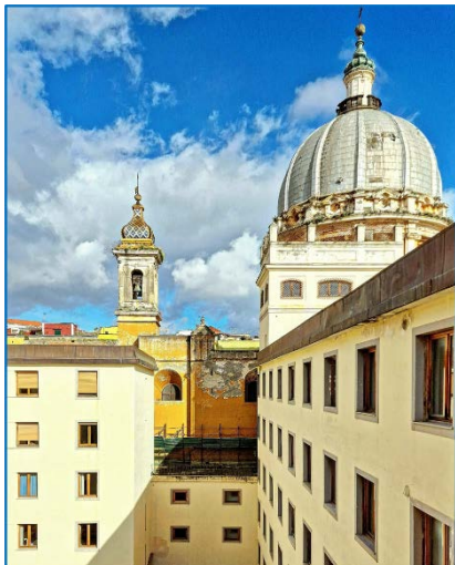
University of Naples Federico II.

The Summer School will be held at the Department of Structures for Engineering and Architecture of the